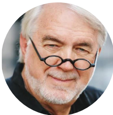
James V. Hart American screenwriter

James V. Hart is an American screenwriter and author. He is known for his literary adaptations, such as Dracula, Frankenstein and Hook. Hart wrote the screenplay to the Steven Spielberg feature film Hook which functioned as a sequel to J. M. Barrie's original story, with Peter as an adult in present times. Later, he wrote the 2005 children's novel Capt. Hook: The Adventures of a Notorious Youth, a prequel depicting Barrie's villain Captain Hook, the nemesis of Peter Pan, when Hook was a youngster. He would then write the Francis Ford Coppola-produced horror films Bram Stoker's Dracula, and Mary Shelley's Frankenstein.